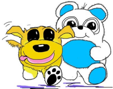
Certified. Force-free. Dog-centred. cheerfuldogswalking.com