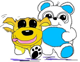
Certified. Force-free. Dog-centred. cheerfuldogswalking.com

Paying attention to details like this allows you to help your family dog feel at her most comfortable. If you notice a slowdown in energy or any physical discomfort, first talk to your vet to rule out medical problems. Like humans, dogs may not welcome all seasons with an equally happy greeting. Observe your dog, note down any changes in a journal, and be proactive in meeting your dog's needs.